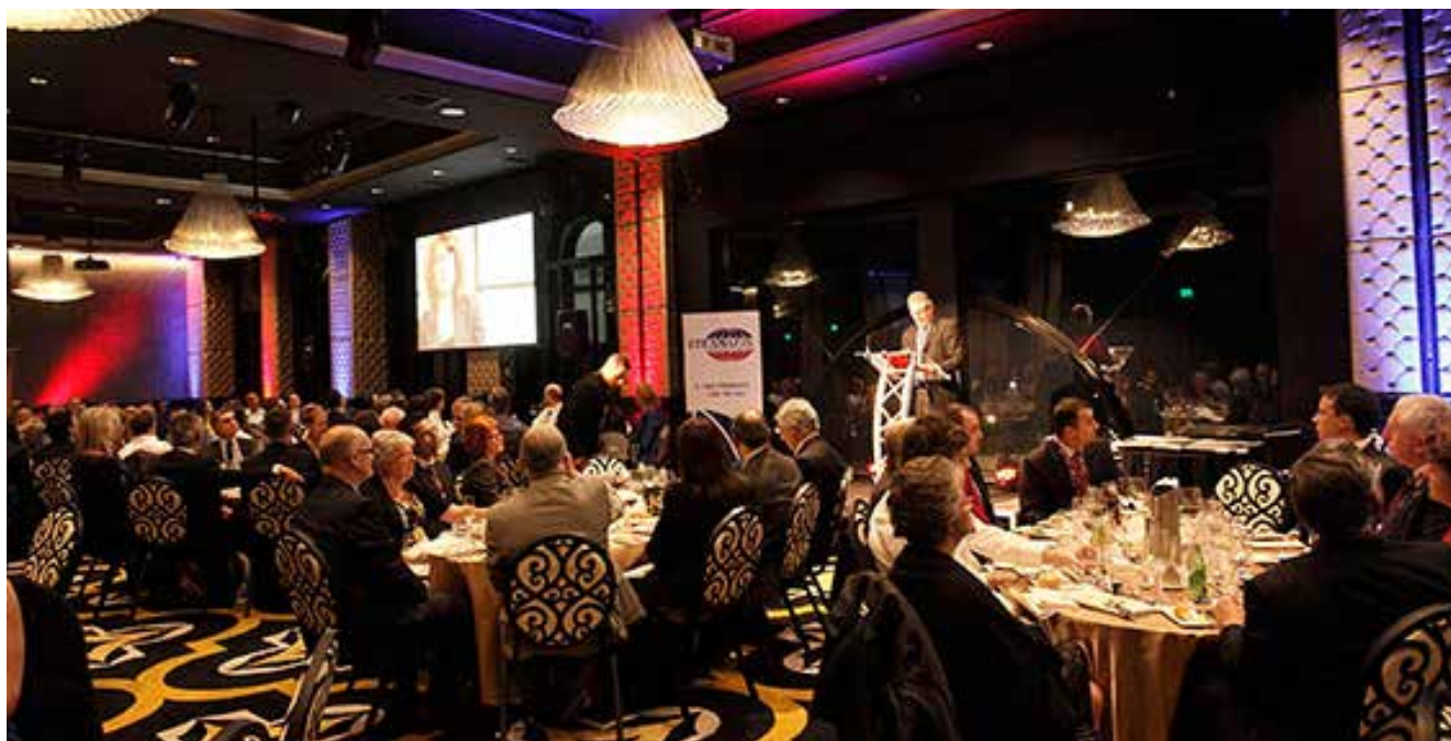
2013 CLAIMS CONVENTION SYDNEY