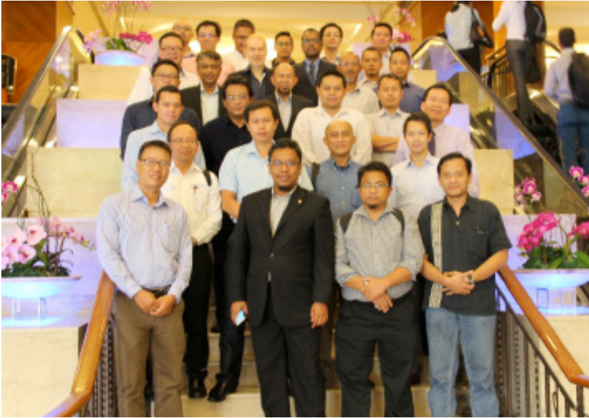
Delegates and Organisers: Technical Workshop on how to Manage Contractors' All Risks Claims

AICLA, in conjunction with the Malaysian Insurance Institute (MII), conducted a technical workshop program on 26th and 27th September 2016 at the Seri Pacific Hotel in Kuala Lumpur.