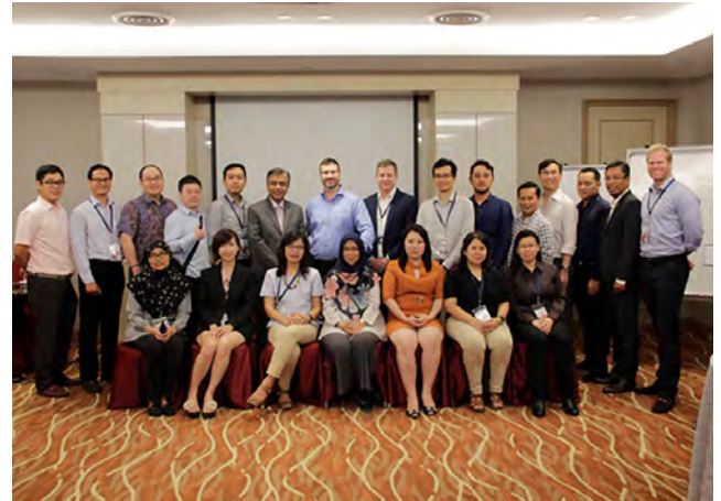
ABOVE: AICLA/MII Workshop – KL on 12th, 13th November — Managing Catastrophe Claims.

Can we become the thought leader in developing cyber claims expertise and promoting relevant skills training and providing specialist services to the industry?